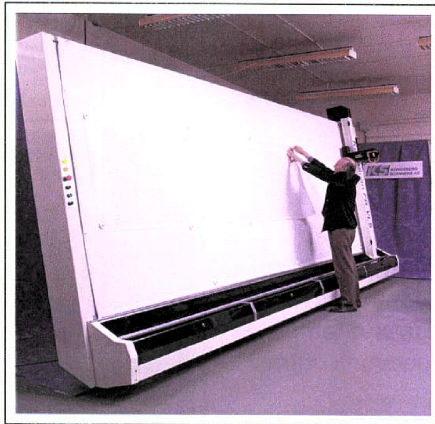
KartoScan FB VLS